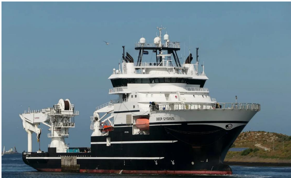
Figure 2. Deep Cygnus

The repairs on the export cable will be completed by the Deep cygnus.